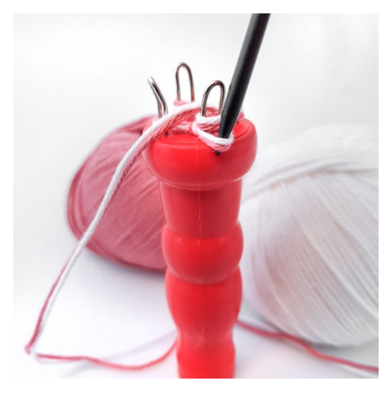
Insert your needle into the bottom loop