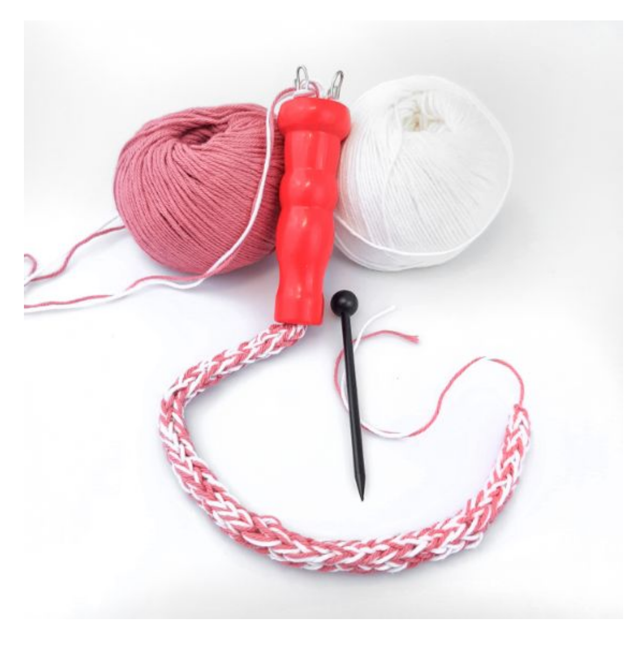
Repeat point 3-7 and pull on the end as you go. It makes the job easier by straightening it out