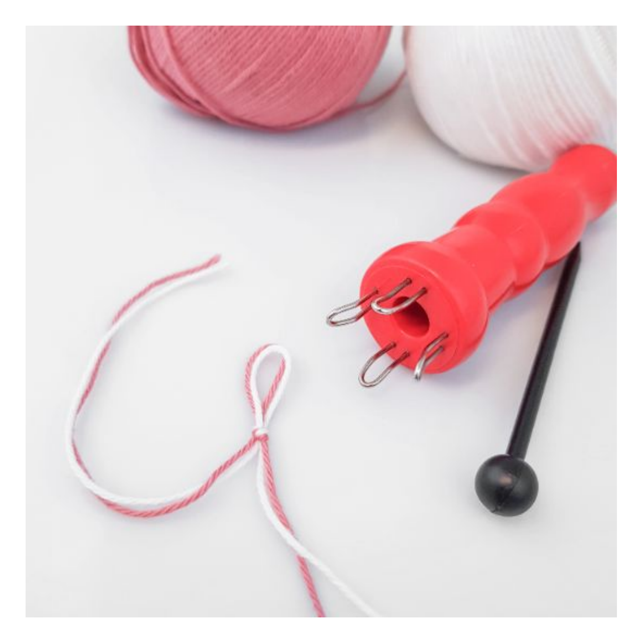
Make a loop on the yarn