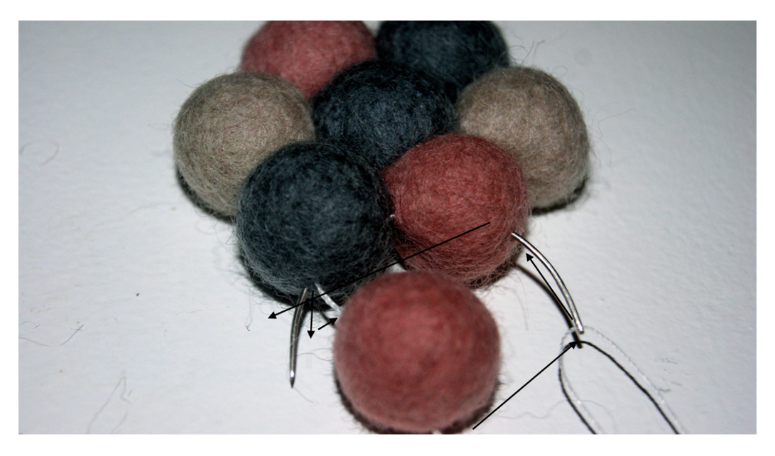
12. Then I continue the pattern as in the first circle.