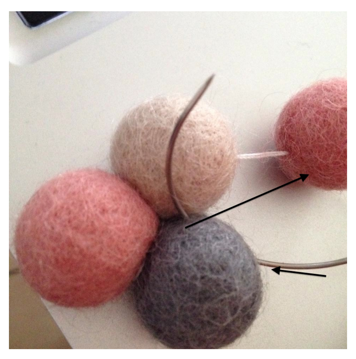
10. Then sew through the "new" ball and out at an angle of 45 degrees and when the cord is out on the other side, pull it in so it looks like this: