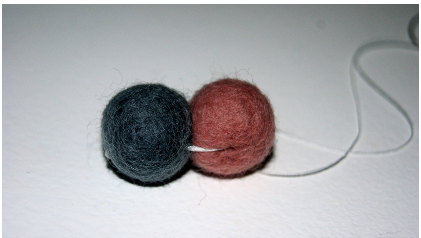
7. The grey ball on this image forms the centre and is thus the inner "circle". When the third ball is to be sewn on, it is important to make sure that it is attached to the ball by both the ball next to it (the