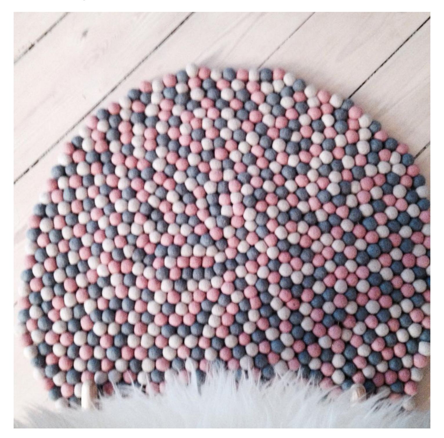
Ball rugs have become very popular in the past year - how to make your own