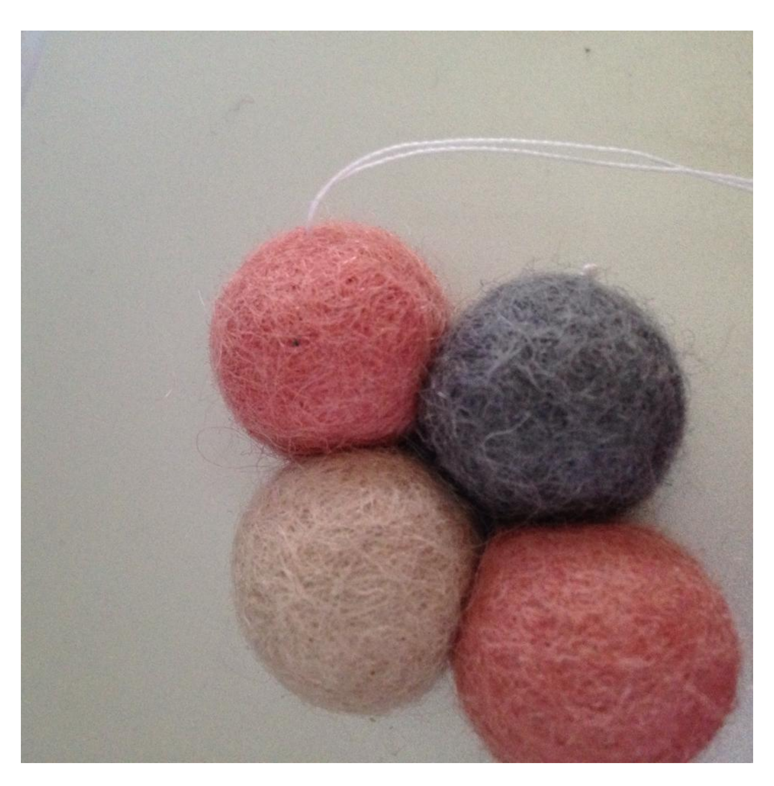
11. Finish a circle this way