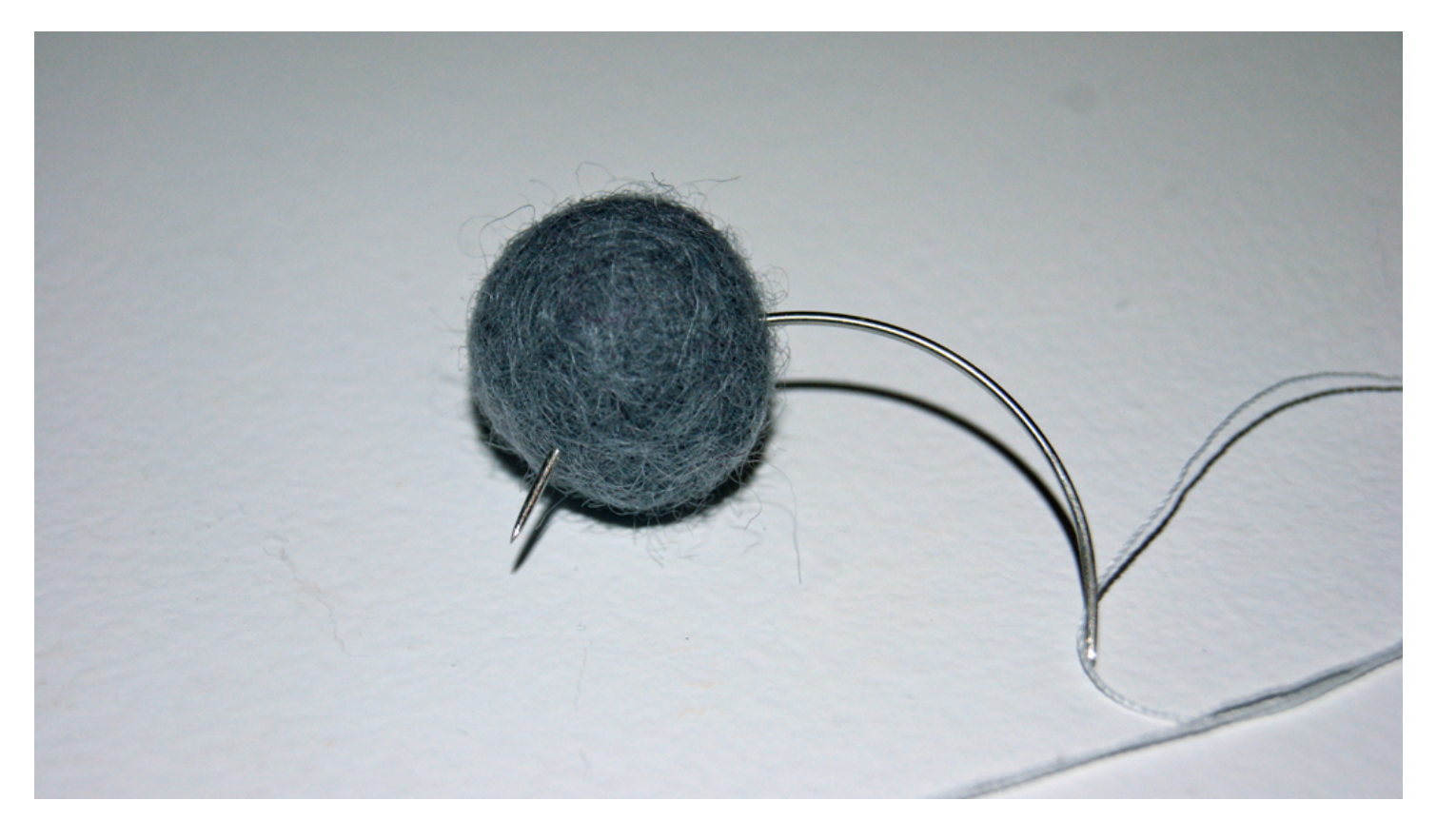
6. The first collection of the balls is slightly different from the upcoming ones.

By using arrows, you can see how the balls are sewn together. It doesn't matter that you can see the thread, because it becomes completely hidden when more balls are added on.