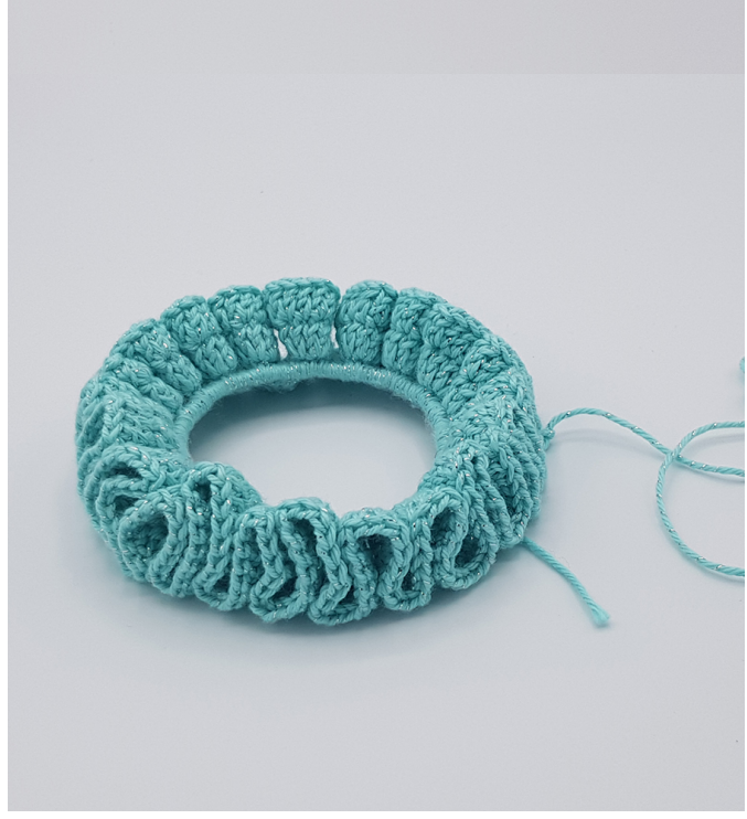
Staple the ends.