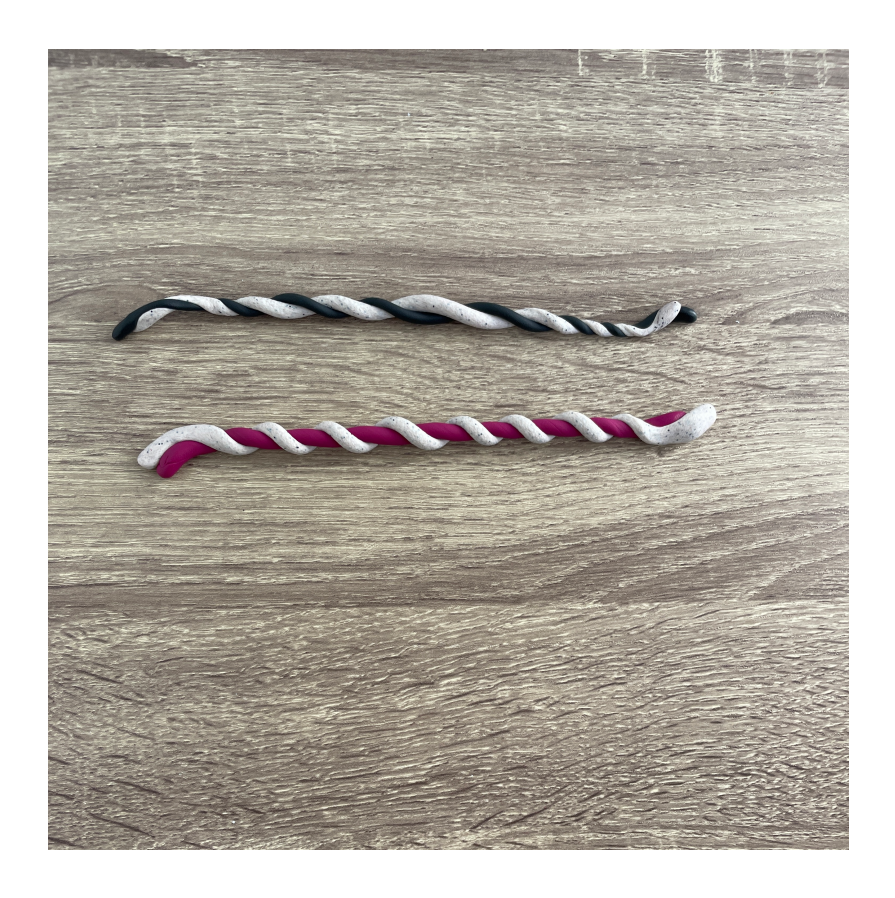
Then put the 2 sausages together and twist them together: