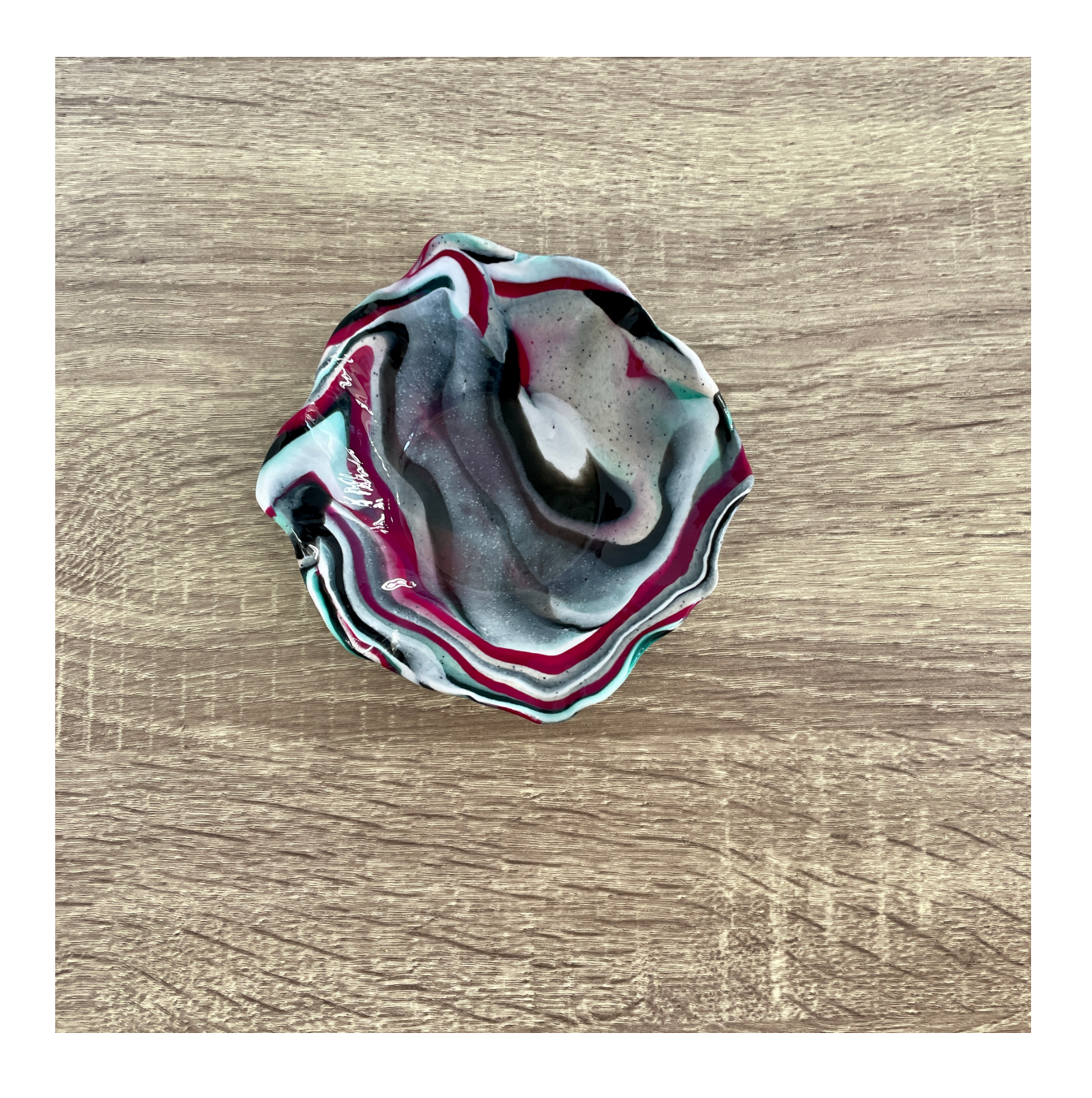
Designed by: @Kreatosse (Majken Andreasen)