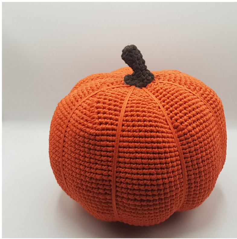
Designed by: thildethordahl (Thilde Thordahl)