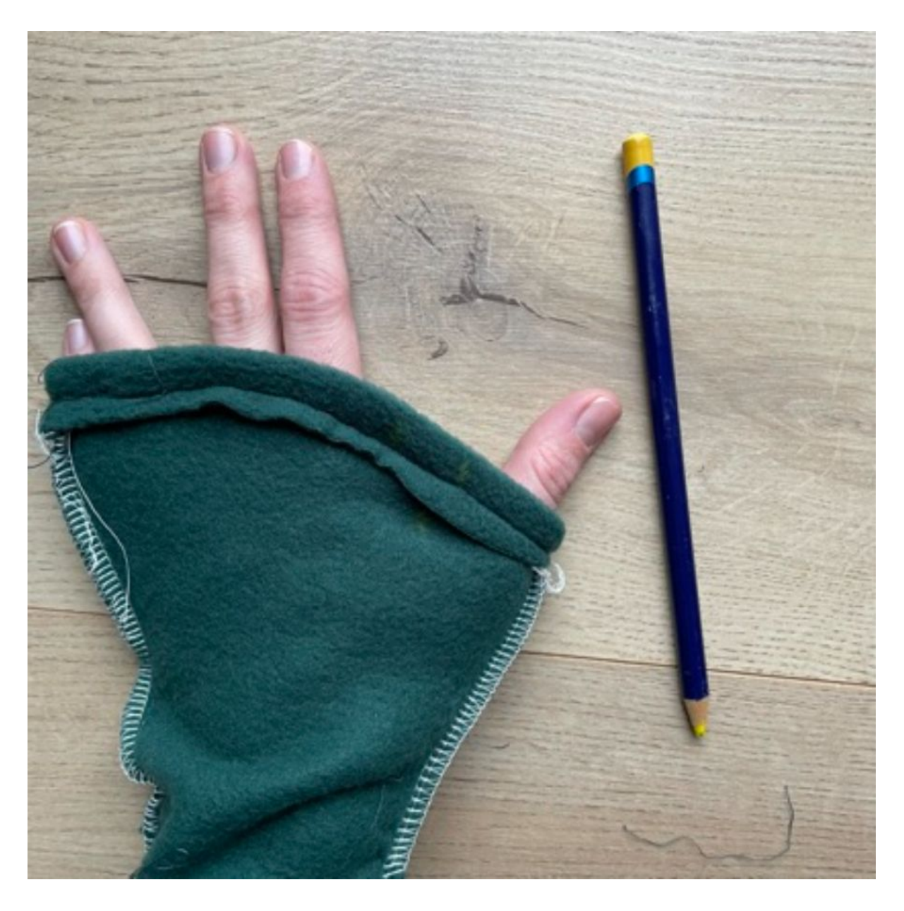
10. On the sewing machine, sew the distance.