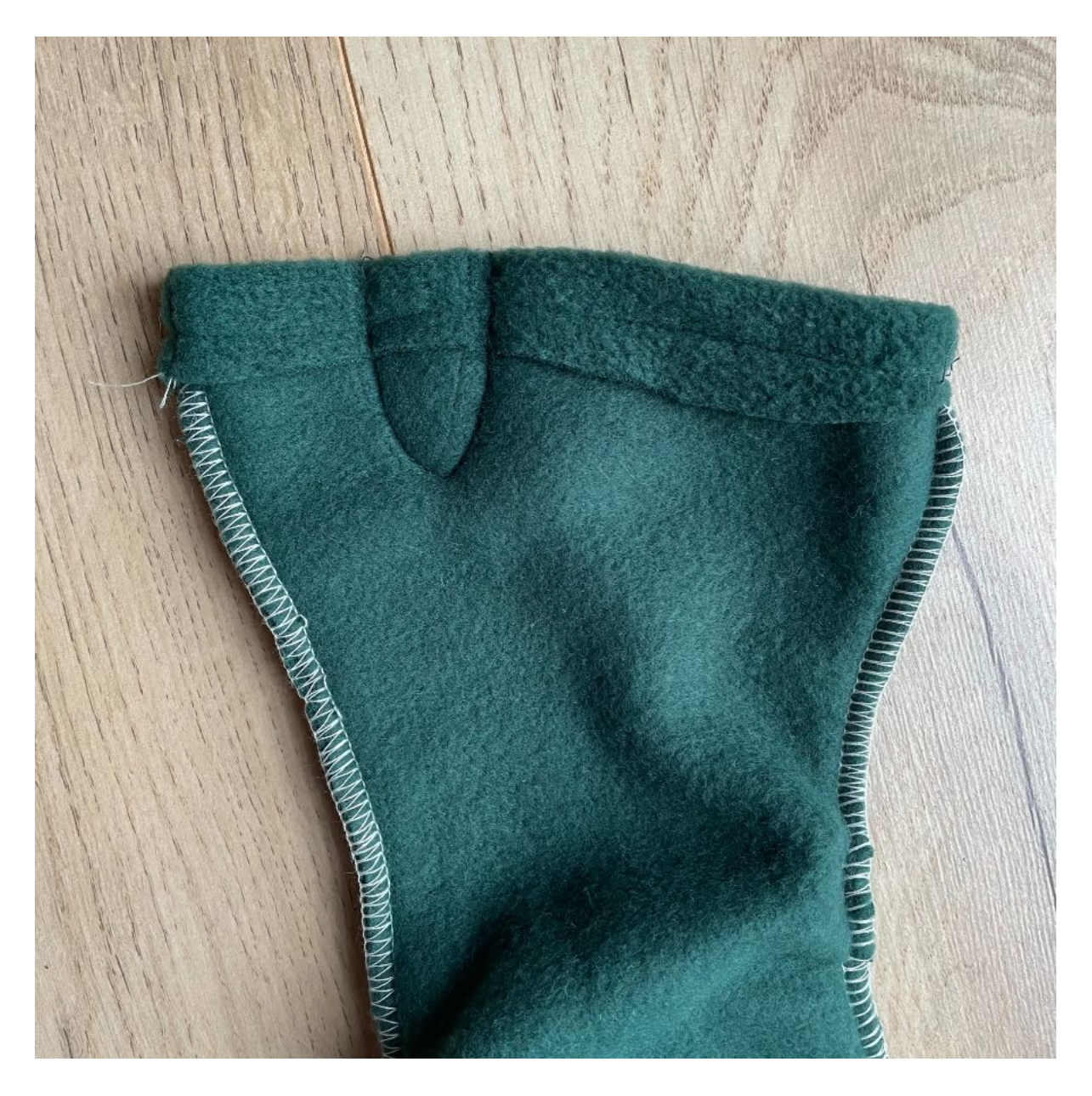
11. Cut out the piece.