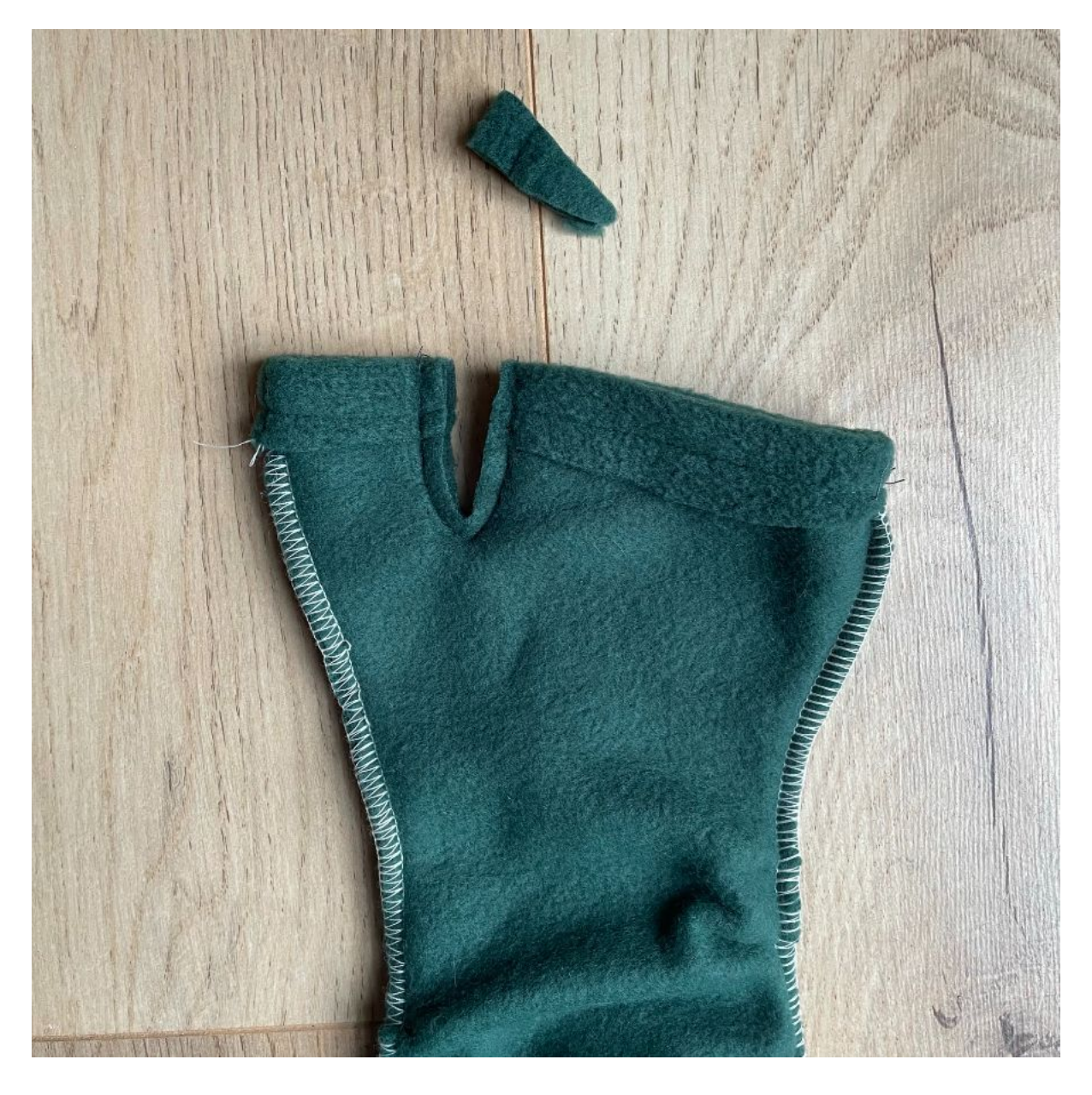
12. Turn the glove right side out and sew another glove like it.