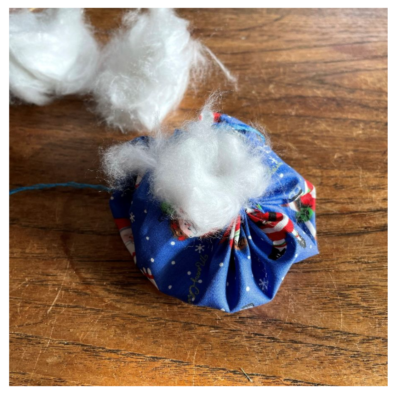
7) Tighten the thread completely. You now have a Christmas ball.