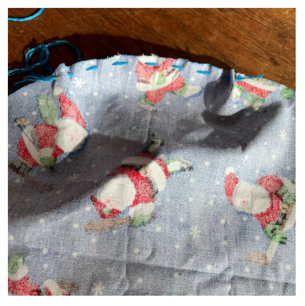
5) When you have sewn around the edge, pull your thread a little so the fabric curls up.