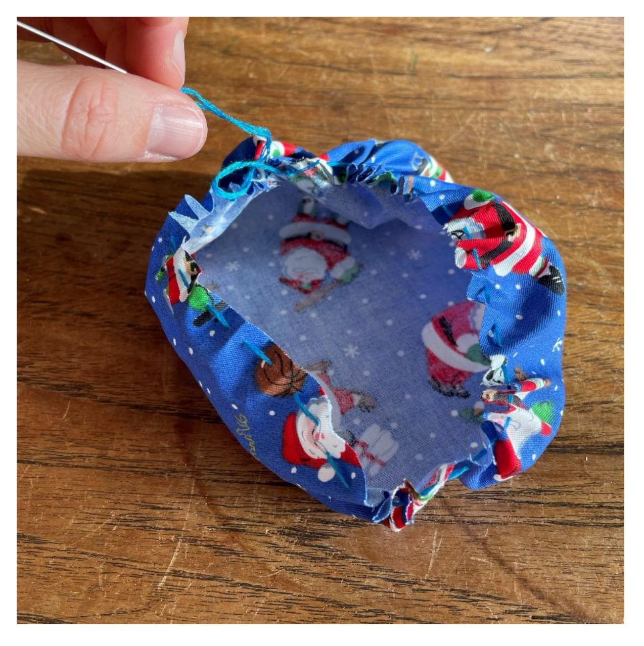
6) Before pulling all the way in, stuff some craft filling into the fabric.